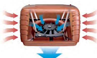
Super Quiet Fan