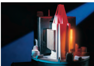
The SynchroDrive Pump

The Brivis Contour series can be connected to the Brivis Networker, Programmable or Manual wall controls.